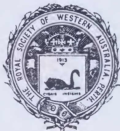
Figure 3. Crest of the Royal Society of Western Australia prior to incorporation.

(9/11/1915). Unfortunately, I could find no description of the design or block, and I presume that it was the design for the Society crest, which first appeared on the cover and front page of Volume 1 of The Journal . The design of the "medallion" (Fig 3), as it was referred to, was apparently not the Gold (Kelvin) Medal, which was not yet in effect. The Constitution booklet, published in 1914, did not have The Society crest.